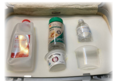
Shown above: the contents of Joan’s “Recycling Buddy Case”